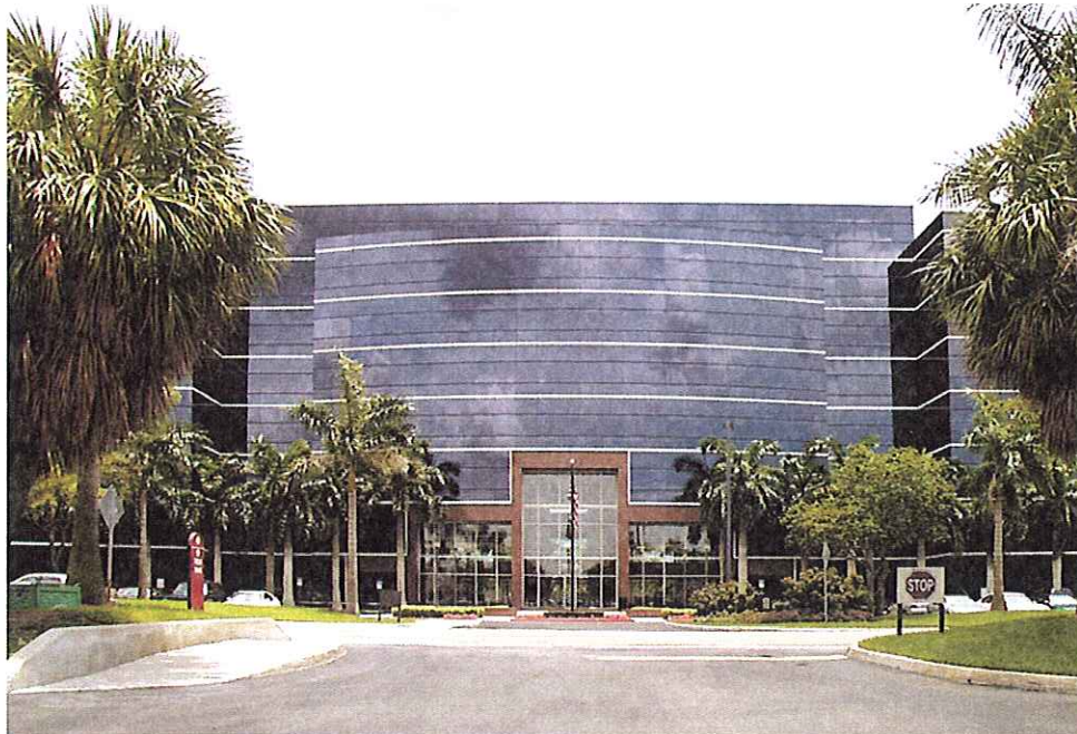
Built in 1987, 7300 Corporate Center Drive is a seven story, 240,000 square foot building home to Assurant, Inc., South Florida Workforce and the Hines Property Management Office .